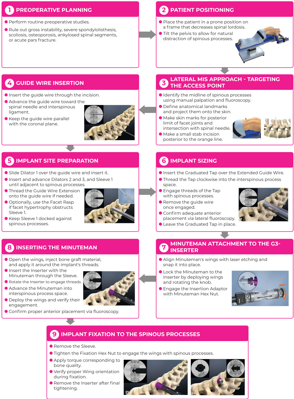
Figure 3 Flowchart describing the surgical process and technique.