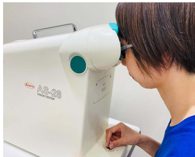
Figure 1 Functional visual acuity measurement system (AS-28, Kowa, Aichi, Japan).

decrease in size automatically with correct answers; when the responses are incorrect, larger optotypes are presented automatically. When there is no response within the set display times, the answer is considered an error and the optotype enlarges automatically. Subjects delineate the orientation of the automatically presented Landolt rings using a joystick. The system can measure VA levels from 30/20 to 20/200. The presentation time of an optotype was adjusted to 2 seconds, and the optotypes changed automatically even if the subjects missed responding within 2 seconds. The VA for 60 seconds was recorded in this study. The testing was performed with the subjects blinking spontaneously, and the continuous VA changes were plotted (Figure 2). The FVA was defined as the average of all VA values measured over time, because this average may reflect the daily vision more accurately than the VA measured at a specific time point. The BDCFVA was measured with the best correction for distance; the BDCFVA and BDCNFVA were measured with -1.5 diopters (D) and -2.5 D added to the best distance correction respectively, which was equivalent to the mean DCIVA and DCNVA measured continuously for 60 seconds.