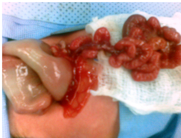
Figure 2 Macroscopic appearance of the intestine during laparotomy, twin 1.

were inserted through a jejunal stab wound, closed by 3/0 Vicryl purse-string suture, the balloon was inflated, and the intestine was fixed to the inner abdominal wall by three opposite 3/0 Vicryl sutures. Finally, the Foley catheter and transanastomotic tube were fixed to the skin by a nonabsorbable suture to prevent their dislodgment.