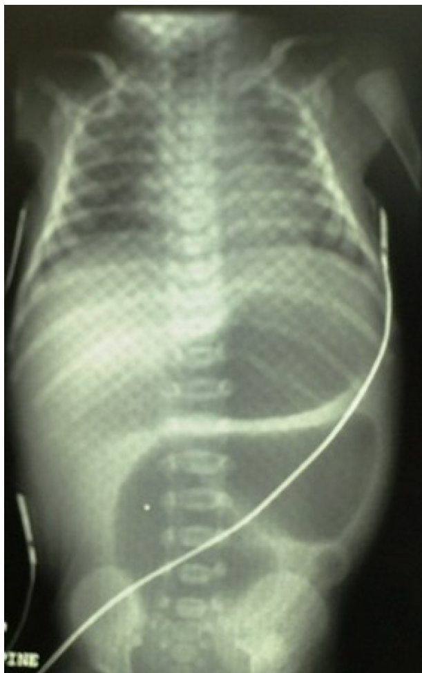
Figure 1 Abdominal preoperative X-ray, twin 1.

the typical appearance of apple peel atresia. The distal small intestine was short (less than 40 cm), with coils around the vascular axis. The disparity in lumen diameter between the proximal and distal tiny loops was about 15 folds (Figure 2).