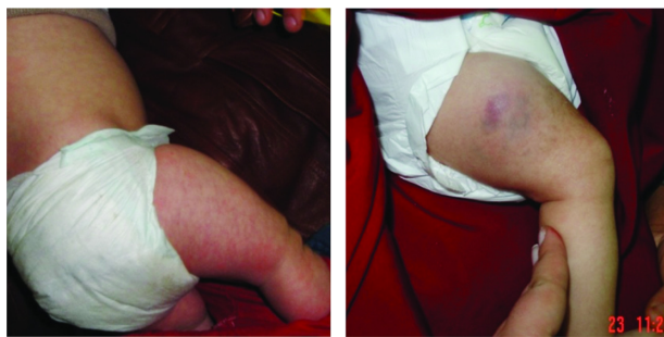
Figure 5 Thigh of a 2-month-old child showing peripheral vascular ischemic changes at 3 weeks from propranolol hydrochloride administration; mottling became more apparent after 4 weeks. These changes were reversible.