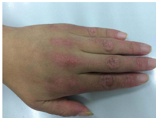
Figure 1 Gottron papules of the patient.