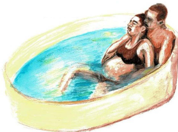
Figure 2 Water birth or immersion illustration.

land or in water). Immersion in warm water has been used for both pain relief and relaxation and has been used in both the first and second stage of labor. 29 Immersion in water may help pain by allowing the parturient to move more freely than on land and position themselves comfortably. It may also help with pain by inhibiting pain signaling pathways. 29