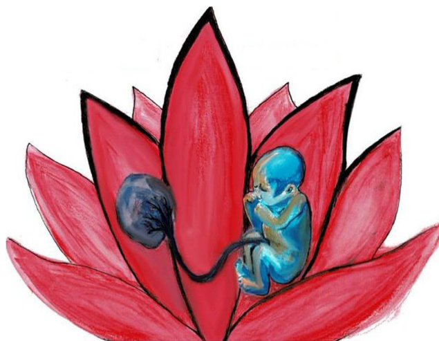
Figure 3 Lotus birth illustration.

placenta together and ensure no pulling on the cord, fear of infection and jaundice. 39 Most participants hid or buried the placenta after separation. There were no reported newborn infections and 1 report of jaundice. 39