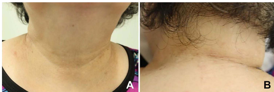
Figure 3 Significant improvement of the lesions at the 2-week follow-up visit ( A and B ).

Based on the clinical manifestations and histopathological findings, the patient was diagnosed with GP of the eccrine ostium. She was advised to avoid excessive heat and keep her intertriginous areas dry. At the 2-week follow-up visit, the lesions significantly improved ( Figure 3A and B ).