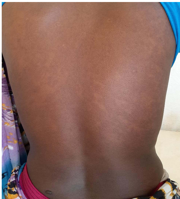
Figure 4 Shows fully recovered skin after a six-month follow-up visit.

the patient consented for her anonymized details and images to be published in an international journal. Ethical approval for publishing case reports was not required by the Ministry of Health of the State of Eritrea.