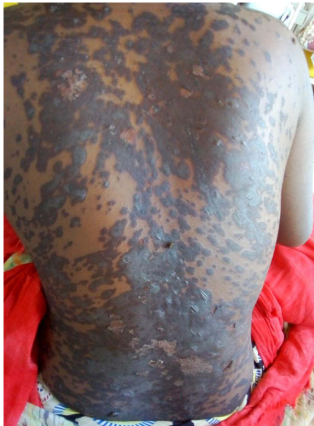
Figure 3 Shows skin lesions developed at the fifth day of initiation of misoprostol tablet.

environment was prone for nosocomial infection. he patient was also isolated in a separate and relatively clean room to prevent nosocomial infection. Following hydrocortisone injection, the patient reported marked reduction in pruritus without improvement to the skin lesion, which progressed over the next two days that involved all extremities and partly her face. After four days of treatment with hydrocortisone, it was shifted to prednisolone tablet 30 mg, twice daily.