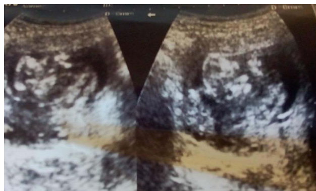
Figure 1 Trans-abdominal sonography showed non-alive fetus with gestational age of 12 weeks by crown rump length.

The patient was managed with hydrocortisone 100 mg intravenously four times daily, normal saline 0.9% infusion, ibuprofen 400 mg tablets three times daily, and chlorphenamine maleate tablet 4 mg three times daily. Ampicillin 1 gram intravenously every six hours was also started as prophylaxis because the skin barrier was broken and the hospital