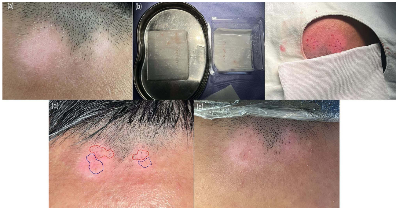
Figure 2 A case of hairline vitiligo. (a) Preoperative view. (b) Place the sectioned grafts separately. (c) The intact half follicles to the hairy areas within the hairline, and the sectioned mini-punch grafts with the half hair follicles removed to the forehead outside the hairline. (d) Hair loss and repigmentation were observed in the area of the forehead outside the hairline (the blue dashed circles). In the area of the hairy areas within the hairline, growing hair shafts and repigmentation were observed, without hair loss (the red dashed circles). (e) Followed up with calcipotriol and betamethasone ointment. Significant improvement after 7 weeks of the sectioned mini-punch grafting.

patient was followed up with calcipotriol and betamethasone ointment, and significant improvement after 7 weeks (Figure 2e).