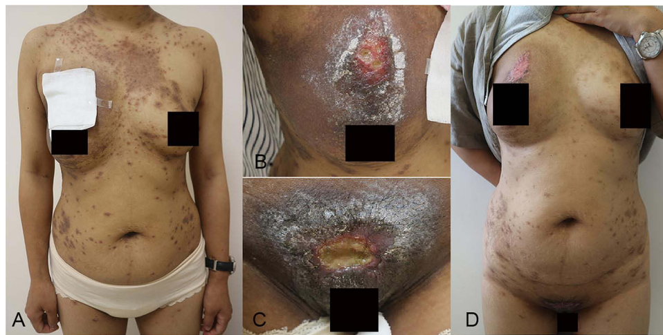
Figure 2 Clinical manifestations in a 38-year-old female with PG and eczema. Scattered ulcers with a small amount of pus on the surface were seen on the right chest and vulva. The ulcers were surrounded by erythema and hyperpigmentation. There were scattered erythema, claw marks, and crusts on the trunk. (A–C) and after 4 months of treatment with baricitinib. Pinkish scarring was seen on the right breast and vulva. There was scattered pigmentation on the trunk. (D).

vessel wall and overflow of large red blood cells (Figure 1F–H). PG should be considered combined with the patient's clinical manifestations and examination after mycobacterial and fungal infections have been ruled out.