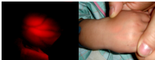
Figure 1 Pediatric peripheral venipuncture and intravenous cannulation into the dorsum manus were attempted with or without the use of transmitted light. The shape of the vein in the dorsum manus can be clearly recognized by the transmitted light.

Of the 10 anesthetists in our department, the newest/least experienced anesthetists and the most senior anesthetists were excluded as inserters in this study, because the success rates of PPV and PPIVC should be adjusted to the average level. Therefore, five anesthetists (training period 3–5 years) were chosen to perform the PPV and PPIVC. Their usual success rates for PPIVC were approximately the same as the average level indicated in a previous report (52%). 1