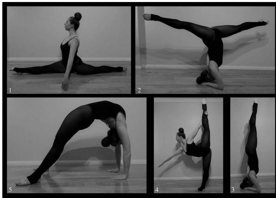
Figure 3 Common calisthenics skills: from top left going clockwise; 1. Split, 2. Tigerstand Split or Headstand Split, 3. Tigerstand or Headstand, 4. Standing Split or Held Arabesque, 5. Bridge.

of injuries included higher hours of calisthenics training during the week (Coef=0.12, 95% CI=0.02 to 0.21, p=0.014 ), higher home training hours (Coef=0.17, 95% CI=0.07 to 0.28, p=0.001 ), higher training hours in other sports (Coef=0.08, 95% CI=0.03 to 0.14, p=0.005 ) and participation at national level/state team (Coef=0.19, 95% CI=0.06 to 0.32, p=0.004 ). Laterality had no association with side of injury for either arm or leg ( p>0.05 ).