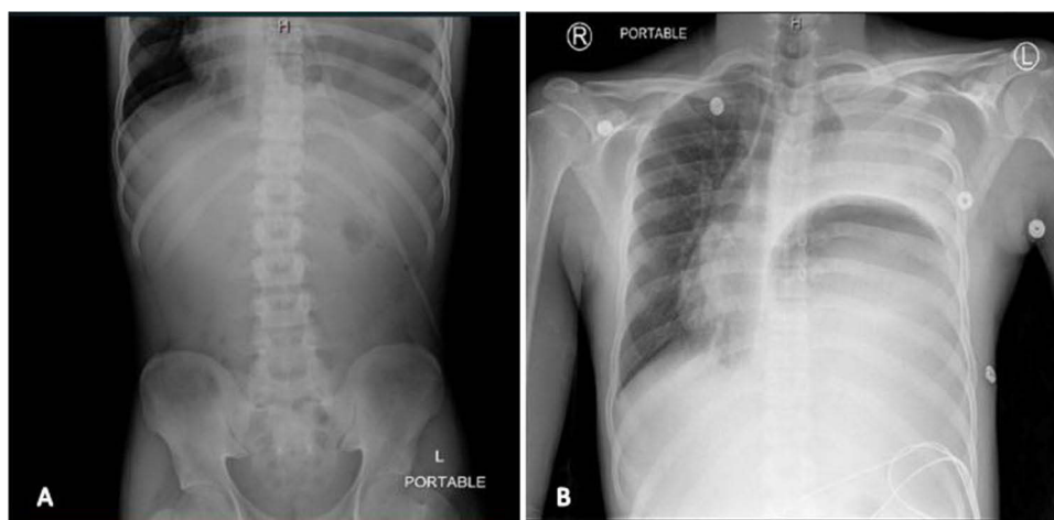
Figure 1 (A) Nonobstructive bowel gas pattern with minimal to absent air in the bowel loops. Haziness in left lung base due to left effusion with possible left basilar atelectasis. (B) Diffuse opacification of the left hemithorax with a large curvilinear lucency within the left hemithorax which were concerning for possible left diaphragmatic hernia.

The following day, the patient became persistently tachycardic to 140 and experienced mild respiratory distress. Due to these abnormal findings, he was subsequently transferred to the pediatric intensive care unit, where vital signs at admission were temperature 36°C, heart rate 143, respiratory rate 35, blood pressure 115/76, and oxygen saturation 98% on room air. Physical exam at this point was notable for dry oral mucosa and diminished breath sounds at the left mid-