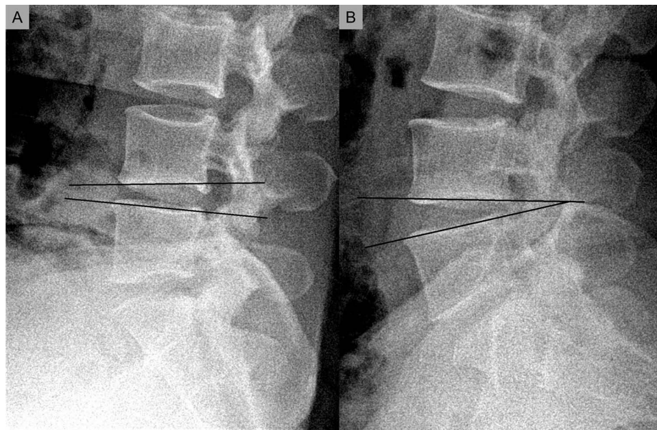
Figure 2 Angular instability in the sagittal flexion (A) and extension (B) views on plain radiography. Black line indicates the angular changes of adjacent upper and lower vertebra that occurs during flexion and extension.

determined by clinical evaluation or plain radiography concurred with that on the post-injection confirmation MRI, and a non-corresponding group, which comprised patients without this concurrence.