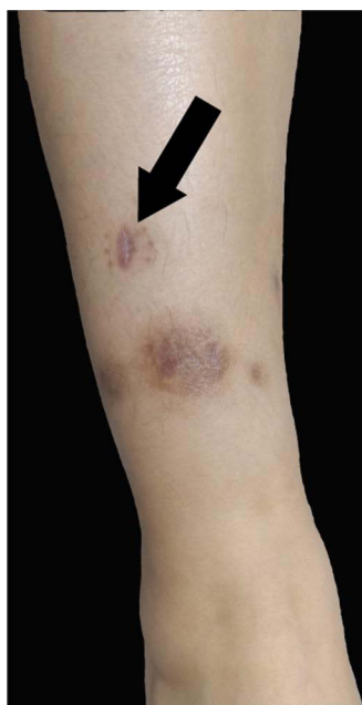
Figure 4 After the treatment of methylprednisolone and tofacitinib, the ulcer was healed and other lesions were subsided.