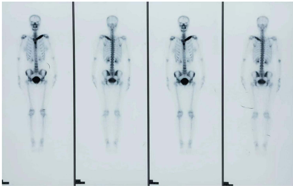
Figure 2 ^{99m}\text{Tc} -MDP bone scintigraphy showed an abnormal nuclide concentration in left clavicle region accompanied by left clavicle deformation.