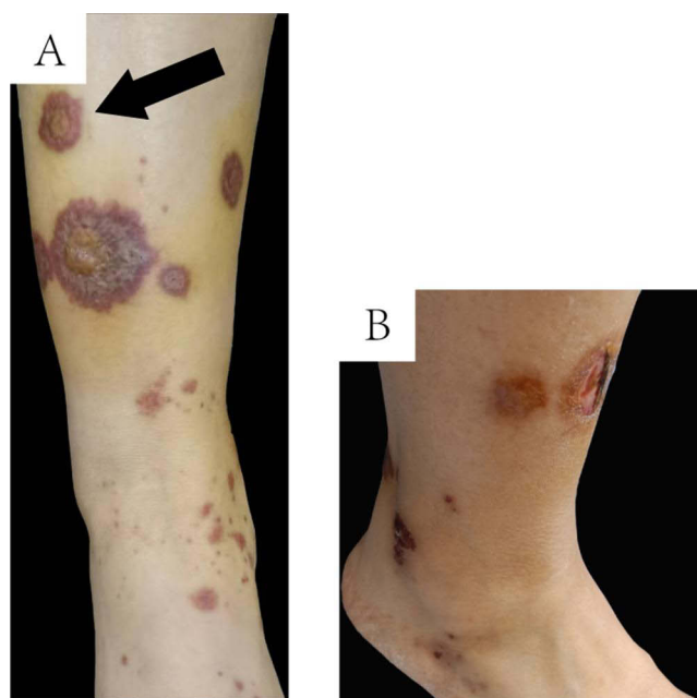
Figure 1 The cutaneous manifestation. (A) The maculopapular rash in dark purple appeared on the lower extremities; (B) The lesion in the pretibial skin rapidly progressed into 1-centimeter-sized ulcer.

The co-occurrence of PPP and characteristic osteoarticular findings in the midshaft of the left clavicle and the sternoclavicular joint suggested the diagnosis of SAPHO syndrome, according to the diagnostic criteria by Kahn in 2003. 7 The skin lesion and the associated histopathological examination suggested the diagnosis of HSP based on the diagnostic criteria by EULAR/PRINTO/PRES in 2010. 8 Oral methylprednisolone (20mg per day) was prescribed in light of the hyperinflammatory state and the severe symptoms. Skin ulcer began to heal and the rest of the skin lesions gradually scabbed and subsided 4 days later (Figure 4).