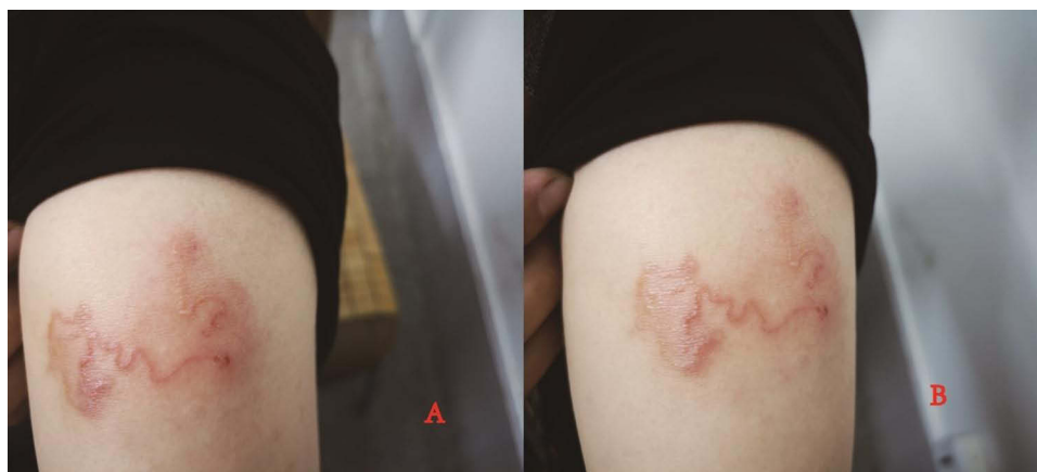
Figure 1 Clinical presentation of the patient on admission ( A and B ) dark red, linear, spiral patches on the lateral side of the upper arm).

Laboratory testing showed completely normal humoral and cellular immune function. A blood test revealed a white blood cell count of 7.10 \times 10^9/L (reference range: 4.0\text{--}10.0 \times 10^9/L ), eosinophil count of 1.3 \times 10^9/L (reference range: 0.02\text{--}0.35 \times 10^9/L ), and eosinophil percentage of 18.5% (reference range: 0.005–0.050%). Her routine urine test was normal. At the same time, we performed a dermoscopy examination of the patient's lesion, and found that linear, light-yellow, and dark red block area of unequal width was a tunnel burrow, formed in the stratum corneum by larva migration (Figure 2A). We also saw translucent round structures from the apex of the linear lesion, which had several high refractive dots internally, which might be the larval body or paws (Figure 2B).