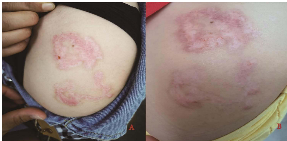
Figure 5 Clinical presentation of the patient after the treatment (A) after one month of the treatment. (B) after two months of the treatment).