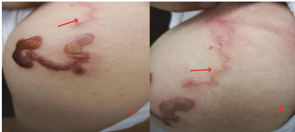
Figure 4 Clinical presentation of the patient after one week of the treatment (A and B) the rash still spread to the proximal part of the left upper arm and left shoulder with red arrows).