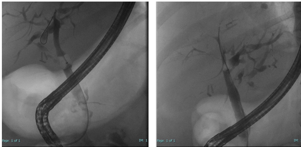
Figure 1 Segmental biliary stricture on ERCP – fluoroscopic view.