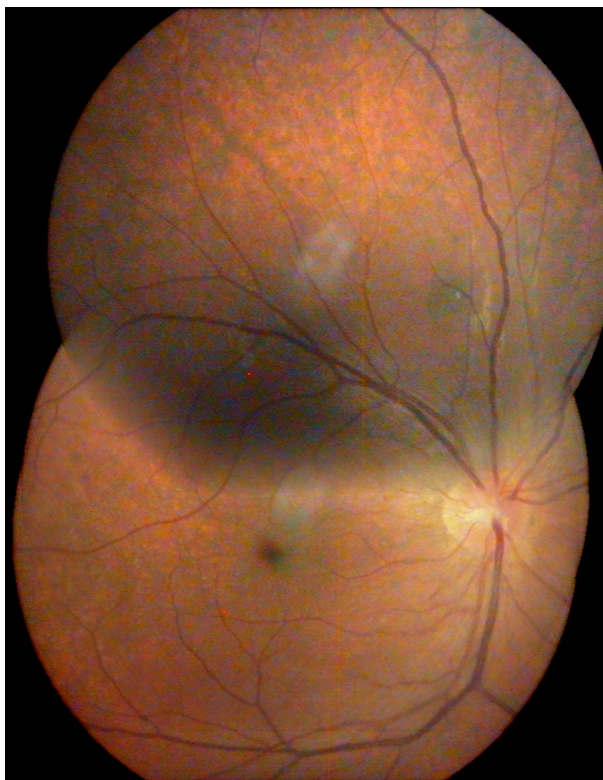
Figure 3 Appearance of the retina 3 weeks after treatment was commenced. Both the retinal detachment and disk edema have resolved.

In our case, VKH could only explain some of the manifestations, such as ocular signs or hair loss, but not the renal failure and hepatitis. On the other hand, ocular alterations have rarely been described in Q fever, with optic neuritis and abducens paralysis being the most common pathology in the literature. However, there are no reports of exudative retinal detachment. Our patient had confirmed Q fever with neurological, hepatic, and renal manifestations. Renal involvement in acute C. burnetii is rare. 9 Our investigations excluded other infective and noninfective causes of acute renal failure, and the patient's condition resolved with appropriate antimicrobial therapy.