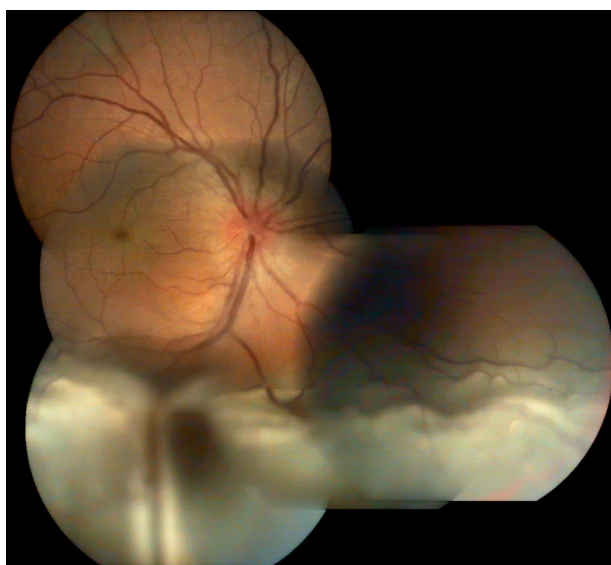
Figure 2 Exudative inferior retinal detachment and disk edema in the right eye, same as in the left eye.

At this point, we changed our treatment strategy and the patient was treated with doxycycline 100 mg every 12 hours for 3 weeks. Two weeks later, visual acuity was 20/20, the