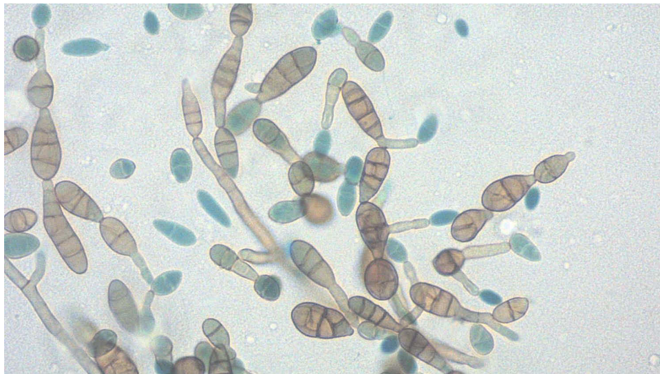
Figure 2 Microscopic examination of the colonies: pigmented septate hyphae with chains of ovate conidia with transverse and vertical septa.

consists of an automated microbial identification system that uses Matrix Assisted Laser Desorption Ionization Time-of-Flight (MALDI-TOF).