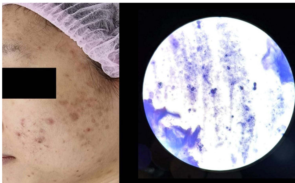
Figure 2 Acne vulgaris with Malassezia folliculitis.

Note: Methylene blue staining demonstrated numerous bacillus bacteria with multiple blastospores (original magnification \times 1000 ).