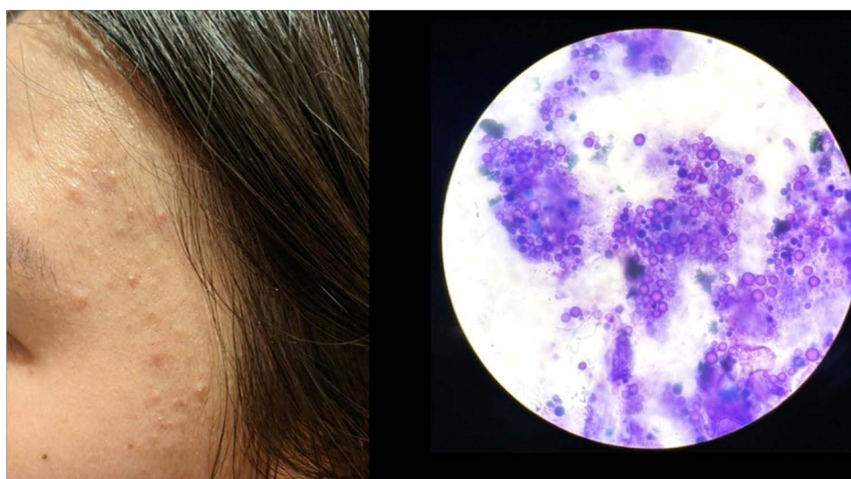
Figure 3 Malassezia folliculitis.

Note: Methylene blue staining demonstrated numerous bacillus bacteria with multiple blastospores (original magnification \times 1000 ).