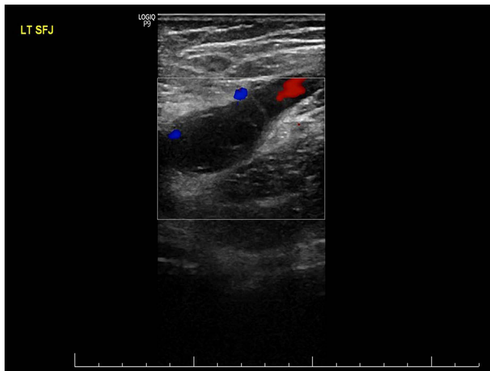
Figure 2 Ultrasound on presentation demonstrating acute deep venous thrombosis (DVT) of the saphenofemoral junction.