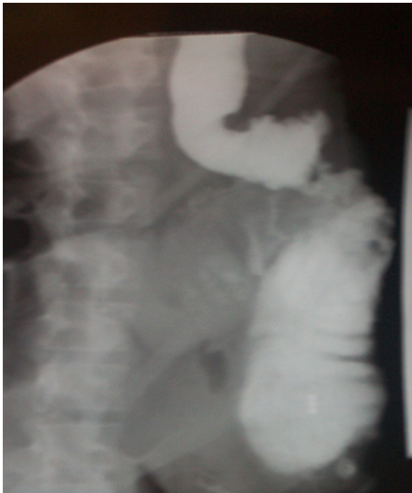
Figure 2 Single contrast enema identifying a stricturing lesion in the left colon.

Subsequent histopathology identified Schistosomiasis haematobium , with ova identified within the submucosa, evidence of fibrosis, and granulomatous colitis with a small localized perforation. Treatment with praziquantel was therefore implemented and the patient made an uneventful recovery.