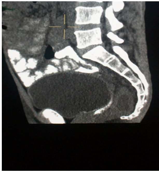
Figure 3 Computed tomography of pelvis.