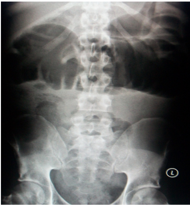
Figure 1 Abdominal X-ray on presentation demonstrating dilated large bowel loops.

Subsequent histopathology identified Schistosomiasis haematobium , with ova identified within the submucosa, evidence of fibrosis, and granulomatous colitis with a small localized perforation. Treatment with praziquantel was therefore implemented and the patient made an uneventful recovery.