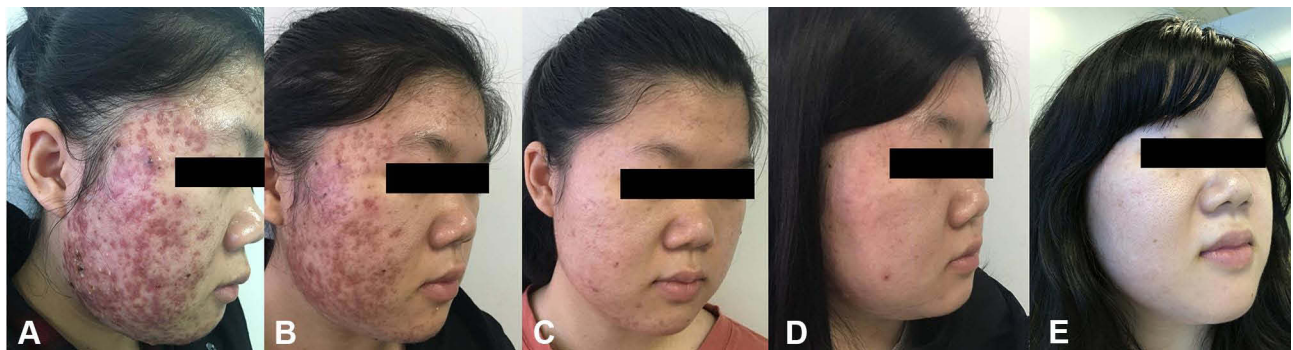
Figure 2 (A) Before treatment. (B) After the end of red and blue light treatment (at second week). (C) After RF treatment (at tenth week). (D) after 2 times of IPL treatments (the 18th week). (E) After 4 times of IPL treatments (the 26th week).

point scale (excellent, good, fair, some, little/no improvement). Figure 2 shows that her postacne erythema had excellent improvement (Grade 5) after 3 stages of treatment in terms of fading in color and reduction in the number of lesions.