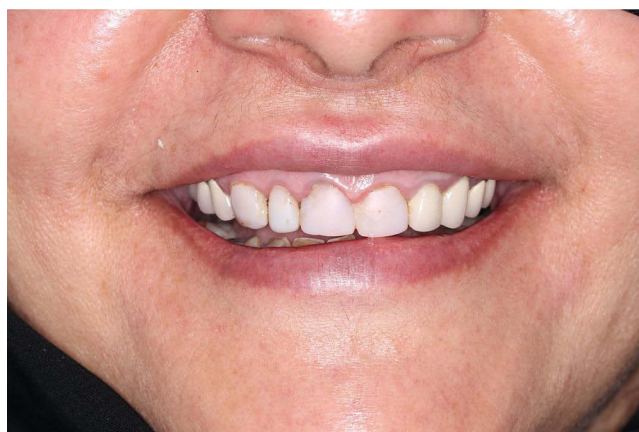
Figure 1 Pretreatment, exaggerated smile view. Note non-ideal gingival display.

This report was approved by the Dental Research Ethics Committee at Riyadh Al-Elm University, and the patient agreed and signed a consent form to publish her case details and accompanying clinical photographs. A 46-year-old woman with a noncontributory medical history presented to the Department of Prosthodontics with the chief complaint of unsatisfactory esthetics of the maxillary anterior teeth (ie, “short teeth”, defective restorations and excessive non-ideal gingival display at rest position/in an exaggerated smile) (Figure 1). The patient had high esthetic expectations. The patient reported nocturnal bruxism (parafunctional habits), and there was evidence of incisal wear and fractured composite facings in the mandibular anterior teeth. Occlusal analysis revealed Angle Class I, overjet of 1 mm, overbite of 3 mm, and mutually protected occlusion during mandibular movements (Figure 2). Clinical and radiographic examinations revealed multiple extractions, root canal treatments (RCTs),