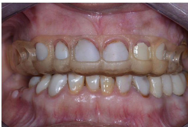
Figure 5 Surgical guide in place.

After the 3 months monitoring period, the patient was scheduled for a definitive restorative procedure. All anterior teeth received lithium disilicate pressable ceramic (IPS e.max Press; Ivoclar Vivadent AG) crowns, which were cemented using adhesive resin cement (Multilink N; Ivoclar Vivadent AG). Maxillary and mandibular posterior teeth received monolithic zirconia crowns which were cemented with resin-modified glass ionomer cement (Ketac™ Cem Plus Luting Cement; 3M ESPE) and screw retained crowns for implants.