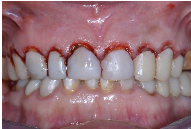
Figure 7 Primary flap design after initial incision using the surgical guide.

At the end of the treatment, the smile that had been proposed and designed digitally was achieved, and the patient was satisfied. At the 1-week follow-up evaluation, the patient was happy and comfortable with her new prostheses, and a maxillary occlusal device (night guard) (Figure 8) was delivered at that time; the patient was instructed to wear it at night to protect the prostheses. The patient was scheduled for a 6-month follow-up program recall interval. After 1.5 years, she was still pleased and comfortable with her smile (Figure 9).