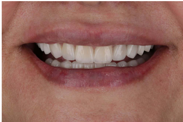
Figure 9 Smile after treatment.