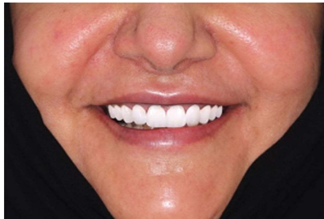
Figure 3 2D proposed smile design.

A combination of both digital and conventional workflows was followed to address the patient's esthetic and functional problems. In the planning phase, a two-dimensional 2D digital smile analysis and design software program was used to examine extraoral and intraoral digital photographs acquired from the patient using a DSLR camera. Once the patient accepted the proposed 2D smile design, an intraoral scanner (Omnicam; Dentsply Sirona Inc.) was used to obtain an intraoral digital scan of both arches. Cone beam computed tomography (CBCT) images were also obtained for both arches. Digital smile design, stereolithographic casts, and CBCT images were used to plan the correct relationship between the proposed tooth/restoration margin, future free gingival margin position, and bone level after surgical resection. The digital workflow described by Passos et al 16 was followed to 3D-design and fabricate a crown lengthening surgical guide (Figure 4A–C). Subsequently, this surgical guide allowed for accurate execution of surgical esthetic crown