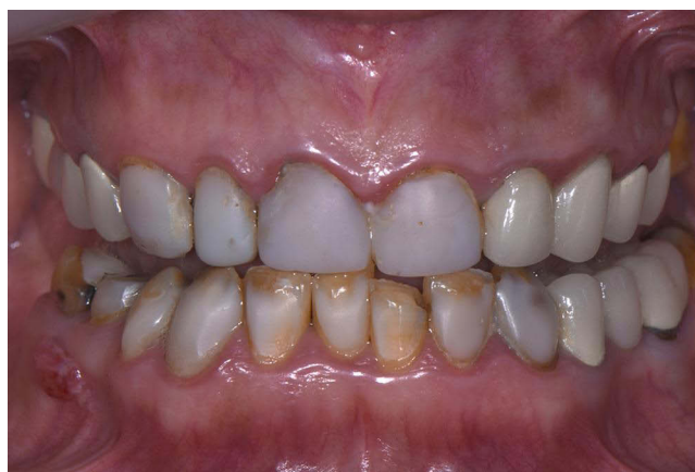
Figure 2 Pretreatment, retracted intraoral frontal view.