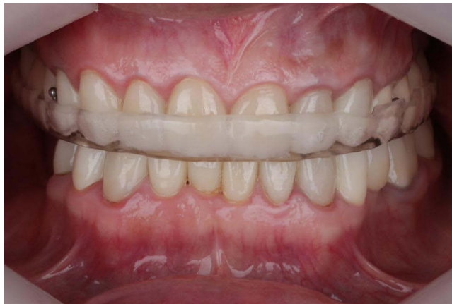
Figure 8 Inserted definitive prostheses with occlusal appliance in place.

At the end of the treatment, the smile that had been proposed and designed digitally was achieved, and the patient was satisfied. At the 1-week follow-up evaluation, the patient was happy and comfortable with her new prostheses, and a maxillary occlusal device (night guard) (Figure 8) was delivered at that time; the patient was instructed to wear it at night to protect the prostheses. The patient was scheduled for a 6-month follow-up program recall interval. After 1.5 years, she was still pleased and comfortable with her smile (Figure 9).