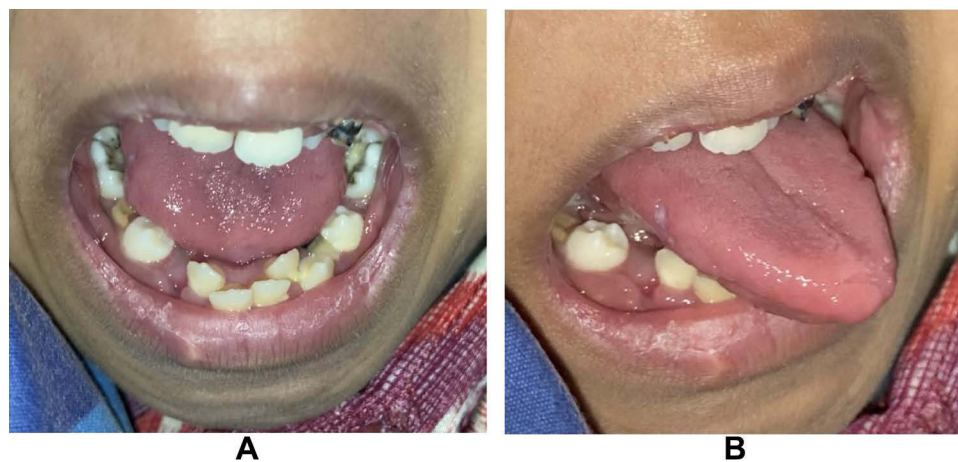
Figure 4 The size of the oral ulcer at the lateral border of the tongue was getting smaller and showed some improvement in the third visit (1-week follow-up).