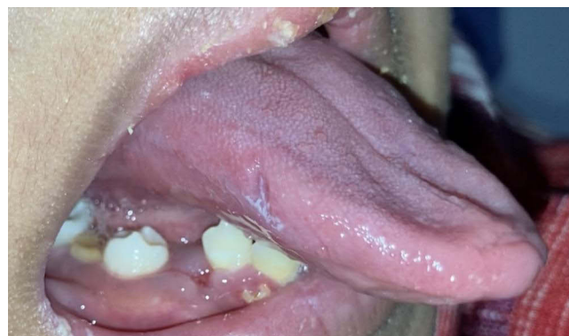
Figure 5 In the fourth visit (10 days follow-up), the size of the oral ulcer at the lateral border of the tongue already had a significant improvement.

In the fourth visit (10 days follow-up), the size of the oral ulcer at the lateral border of the tongue already had significant improvement. Two days after the fourth visit, the patient underwent neurosurgery. The patient was observed in the Pediatric Intensive Care Unit postoperatively. After two weeks of observation in the Pediatric Intensive Care Unit, the experienced respiratory failure and was declared dead [Figure 5].