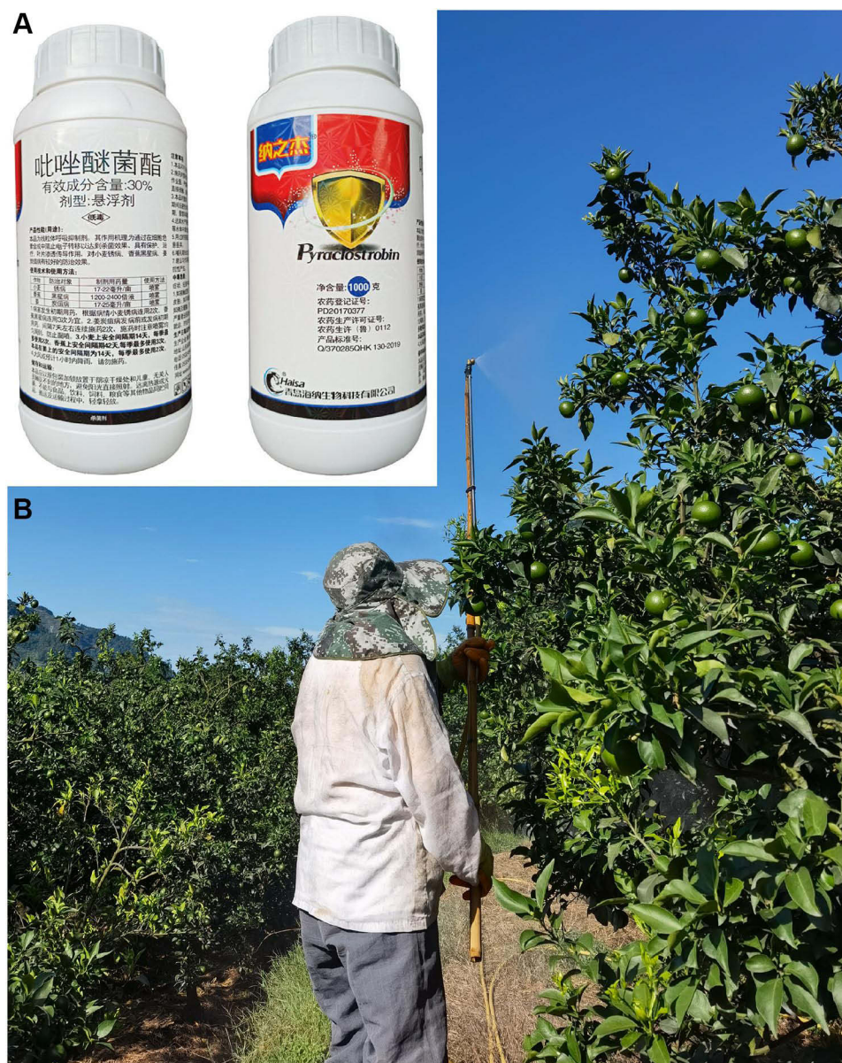
Figure 1 Pesticide pyraclostrobin, Haisa (Qingdao, China, Active ingredient content: 30%; Suspending agent) having been sprayed on the patient's face (A). The patient is using his normal spraying equipment, in his normal protective equipment and clothing, spraying citrus (B).

Treatment methods included intramuscular injection of compound betamethasone injection (CBI) 1mL at the acupoint Zusanli (ST 36) and oral rupatadine fumarate tablets 10mg once a night. Fourth day after intramuscular injection of CBI, the patient's facial swelling and desquamation were significantly improved, and most of the erythema and papules disappeared. (Figure 2C) Complete improvement was observed without dermatitis recurrence at a 4-month follow-up.