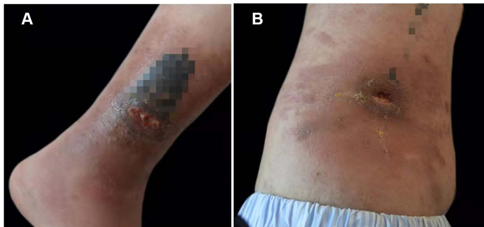
Figure 1 Clinical manifestations at the time of initial presentation. (A) An ulcer and patchy erythema around it on the inner lower third of the right leg, blue tattoos were nearby; (B) an ulcer and flaky dry erythema around it on the right side of the loin, blue Chinese tattoos were nearby. The tattoos have been blurred as patient's privacy.

Histopathological examination of the ulcer of the right leg showed epidermal hyperkeratosis with incomplete keratosis, the stratum spinosum was hypertrophic (Figure 2A), the dermis was permeated with dense lymphocytes and numerous eosinophils infiltrated, some histiocytes and neutrophils were also seen (Figure 2B), no obvious inflammatory cell infiltration was observed in subcutaneous tissue. Fungal culture and nucleic acid tests of tuberculosis and atypical mycobacterium were negative with the tissue. Only staphylococcus epidermidis was positive in wound secretion culture. Routine blood tests, blood glucose, liver and kidney function, and autoantibody spectrum were all negative. Chest radiographs and abdominal ultrasonography showed no abnormal findings. However, serum total IgE was 621.00IU/ mL,