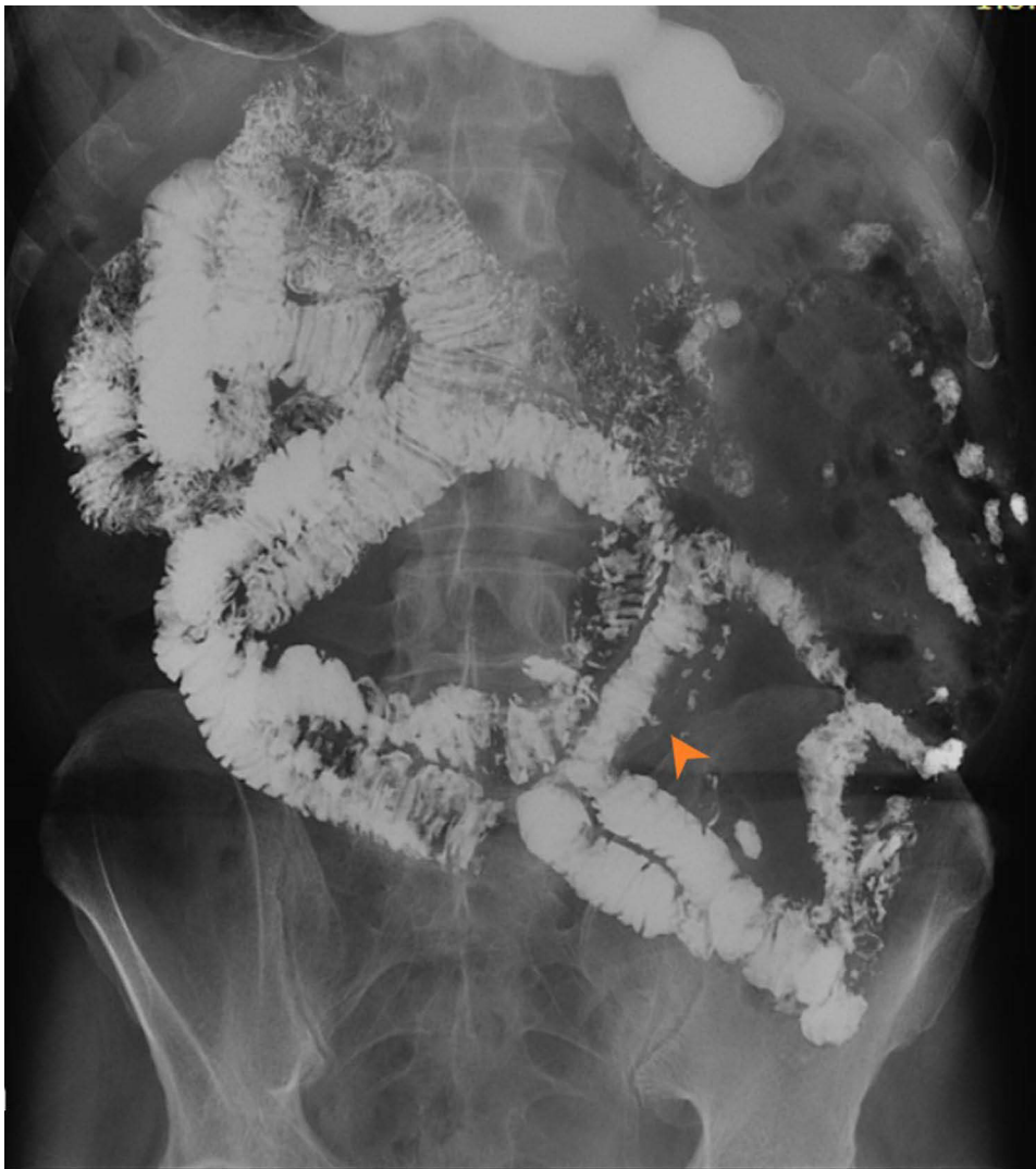
Figure 2 Barium meal follow-through in the follow-up period indicates no evidence of bowel obstruction and absence of enterolith. Multiple small bowel diverticula are noted (Orange arrowhead).

cholecysto-jejunal fistula. The resultant gallstone ileus accounts for less than 5% of mechanical small bowel obstructions. It is rare and develops in less than 0.5% of patients with gallbladder calculus. The patients may have nonspecific symptoms initially but later may manifest features of intestinal obstruction. Since in the beginning, the symptoms may be nonspecific and intermittent abdominal pain, and the X-ray investigations may fail to identify the cause of the obstruction, the diagnosis of intestinal obstruction due to a gallstone may be delayed, and sometimes the diagnosis is made during surgery. 6 The majority of reported cases of obstruction demonstrate a gallstone larger than 20 mm in diameter. The distal ileum (60%) is the most common site of obstruction, followed by the jejunum (15%), stomach (15%), and colon (5%). 7 De novo formation and subsequent transit of an enterolith through the gastrointestinal tract may give rise to colicky pain and intermittent, partial or complete intestinal obstruction. 8 Single enteroliths smaller than 2 cm in size should typically pass unnoticed through the small intestine into the colon. In the event that the enterolith is retained, it may grow in size due to additional calcification and growth and may result in bowel obstruction in the future. 7