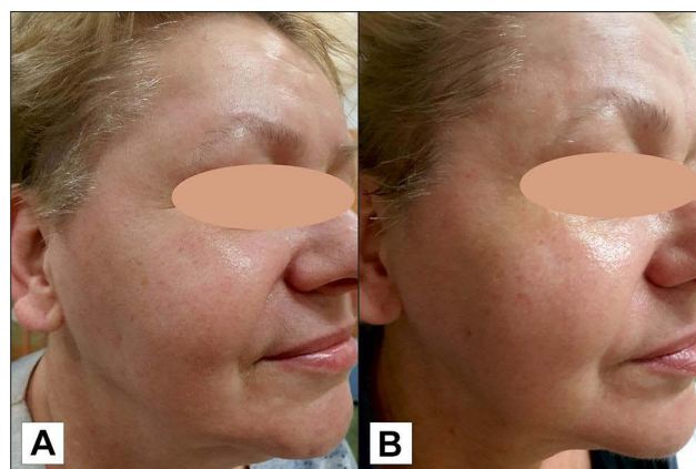
Figure 2 A 61-year-old female patient with diabetes mellitus type 2: (A) at baseline; (B) after a series of radiofrequency treatments. Note: Images property of Daria Sobkowska.