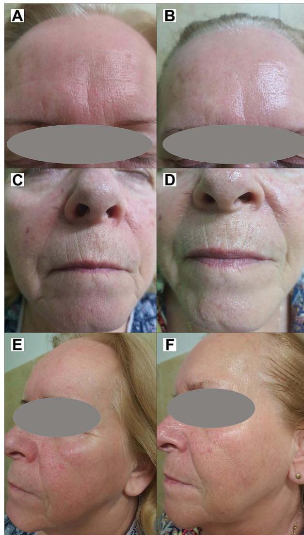
Figure 1 A 63-year old female patient with diabetes mellitus type 2: (A, C and E) at baseline; (B, D and F) after a series of radiofrequency treatments.