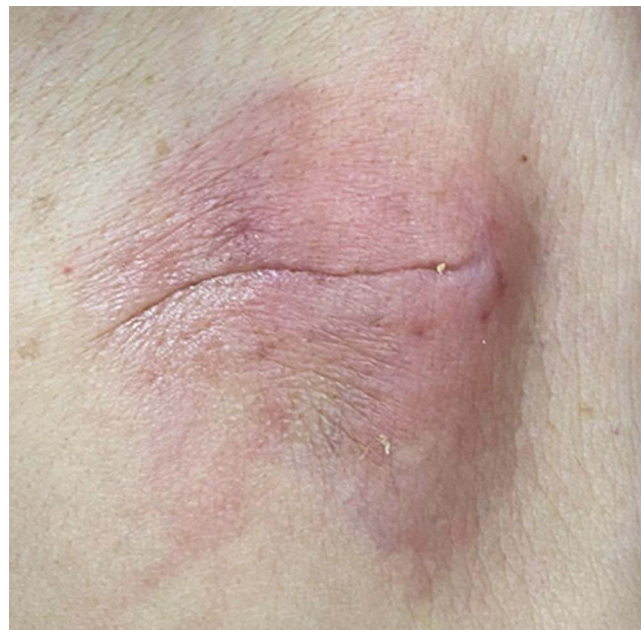
Figure 1 The patient's pacemaker pouch.