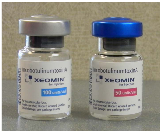
Figure 1 Recently US FDA approved botulinum toxin type A, Xeomin ® (incobotulinumtoxinA).

In August, 2010 the US Food and Drug Administration (FDA) approved Xeomin ® (incobotulinumtoxinA 10 ; Merz Pharmaceuticals GmbH, Frankfurt, Germany) for the treatment of cervical dystonia or blepharospasm in adults (Figure 1). Now Xeomin ® is the fourth BoNT product licensed for the US market, following Botox ® (onabotulinumtoxinA;