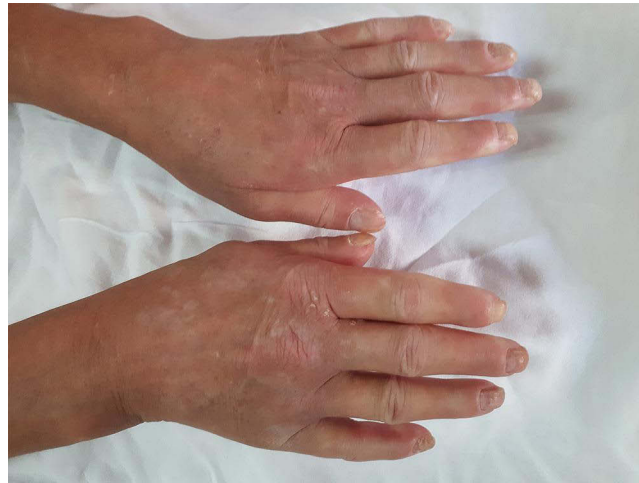
Figure 1 Sclerodactyly and digital contracture in flexion.

Clinically, the general condition is slightly influenced, the patient suffering from discrete asthenia quantified by the score of 20/100 evaluated by the patient using the analog visual scale. There was a gradual weight decrease of 10 kg over the span of 3 years. Arthralgias were present at the bilateral distal interphalangeal joints (8 painful joints with the pain score quantified by the patient using the visual analog scale = 10/100), without joint contracture of the small joints in the hands, with discrete phalangeal muscle weakness at this level (score = 1) and with muscle atrophy of the dorsal interosseous muscles, scleroderma facies with slight microstomy (5 cm oral opening), sclerodactyly (Figure 1) and acrocyanosis of the left II nd finger (Figure 2). Multiple stellar scars with the characteristic appearance of "rat bite" and active digital ulcerations have been identified on the pulp of the fingers. Some ulcers of the II nd and IV th left fingers and I st right finger showed signs of infection (Figure 3). The skin had "salt and pepper" pigmentation disorders, the hyperpigmented areas alternating with the hypopigmented ones. Skin induration was quantified as being 4, calculated as the Rodnan score and obtained by summing the partial