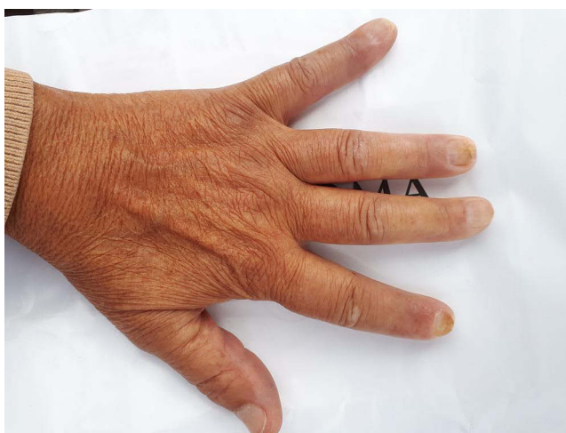
Figure 4 Acroosteolysis of the fingers.

Biologically, there were significant signs of an inflammatory syndrome expressed by increased values of erythrocyte sedimentation rate (ESR = 76 mm/h) and C reactive protein (CRP = 61.92 mg/l) which directed towards the active form of the disease. The immunological profile showed an increased titer of antinuclear antibodies (ANA). Analysis of the extended ANA profile revealed increase in anticentromere antibodies (ACA). Data from the literature indicate that ACAs have high specificity for the limited subset of SSc. The absence of other autoantibodies suggests that the patient does not have other autoimmune diseases, although sometimes the immunological profile of SSc or other autoimmune diseases is negative or atypically. Medication indicated for existing comorbidities may be a source of adverse reactions or may have an anti-cytokine benefit with anti-inflammatory potential in SSc. 15–20