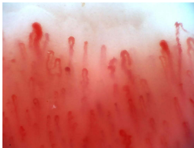
Figure 5 Capillaroscopy – nonspecific pattern, with dilated vessels.

By making a correlation with the capillaroscopic pattern of this patient (Figure 5), one can highlight that the hearing loss could be determined by the microvasculopathy characteristic of SSc. The patient has a nonspecific capillaroscopic pattern for SSc, characterized by a slightly reduced capillary density and frequent dilated capillaries. Some aspects characteristic of SSc are missing, such as: megacapillaries, hemorrhages and neovascularization, but there is a slight structural disorganization and digital necrosis. 2,5 Maciaszczyk and Silva claim that the microvascular damage of the inner ear is due to the vasospasm characteristic of the Raynaud phenomenon associated with fibrosis of the auditory