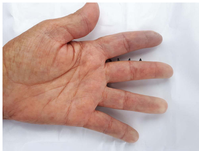
Figure 2 Acrocyanosis left II nd finger.