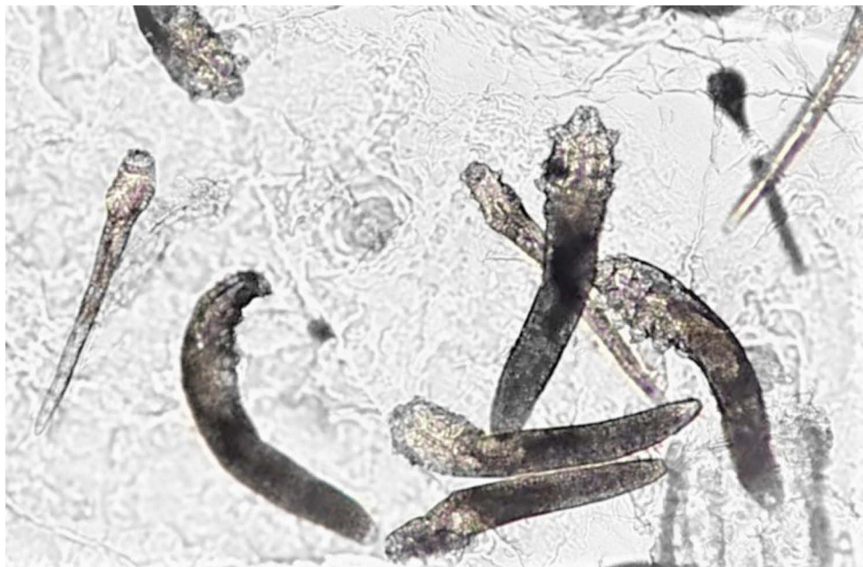
Figure 3 Multiple Demodex mites are detected by standardized skin surface biopsy from the rash on the right cheek.

(SSSB) is commonly used to determine Demodex mite density from skin of the patients. Demodicosis is diagnosed when there is a high density of Demodex mites ( >5 Demodex mites/cm 2 ). 13 A method for assessing Demodex mite density in papulopustular lesions, called “superficial needle-scraping” (SNS), is performed by scraping off 5 small pustules with the tip of a needle for microscopic examination. Demodex mite density was reported as “mites per 5 pustules” for SNS. Demodicosis is diagnosed when there is a high density of Demodex mites, at \geq 3 Demodex mites per 5 pustules. 14 In this patient, the results of microscopic examination revealed an abnormal increase in the number of Demodex mites from both SSSB and SNS methods and, combined with the relevant clinical presentations, led to the