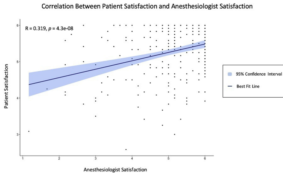
Figure 2 Plot displaying the correlation between patient satisfaction and anesthesia provider satisfaction.

measures, indicating that surgeon and anesthesiologist satisfaction cannot be used to reliably predict patient satisfaction. Moreover, even when individual measures of patient satisfaction, such as pain and anxiety, were isolated, the correlations between provider and patient satisfaction remained low.