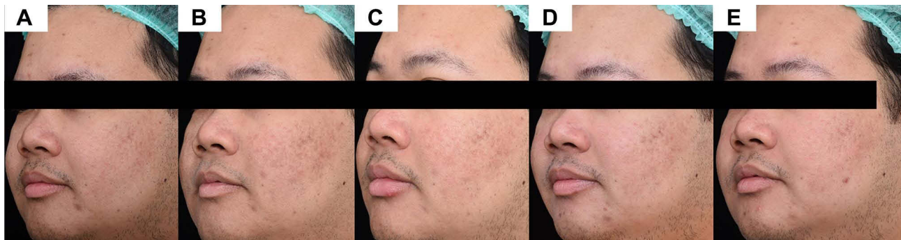
Figure 3 Postoperatively treated side with the sunscreen B. (A) Baseline, (B) 1-week, (C) 2-week, (D) 4-week, and (E) 6-week follow-up visit.

adverse effects were reported. Only some patients were reported to have side-effects while using the sunscreen A, including burning sensation (5.95%) redness (3.38%) dryness (1.28%) and itching (0.43%). All of the aforementioned symptoms developed only at the beginning of the study and were resolved spontaneously without discontinuation of sunscreen or additional treatment.