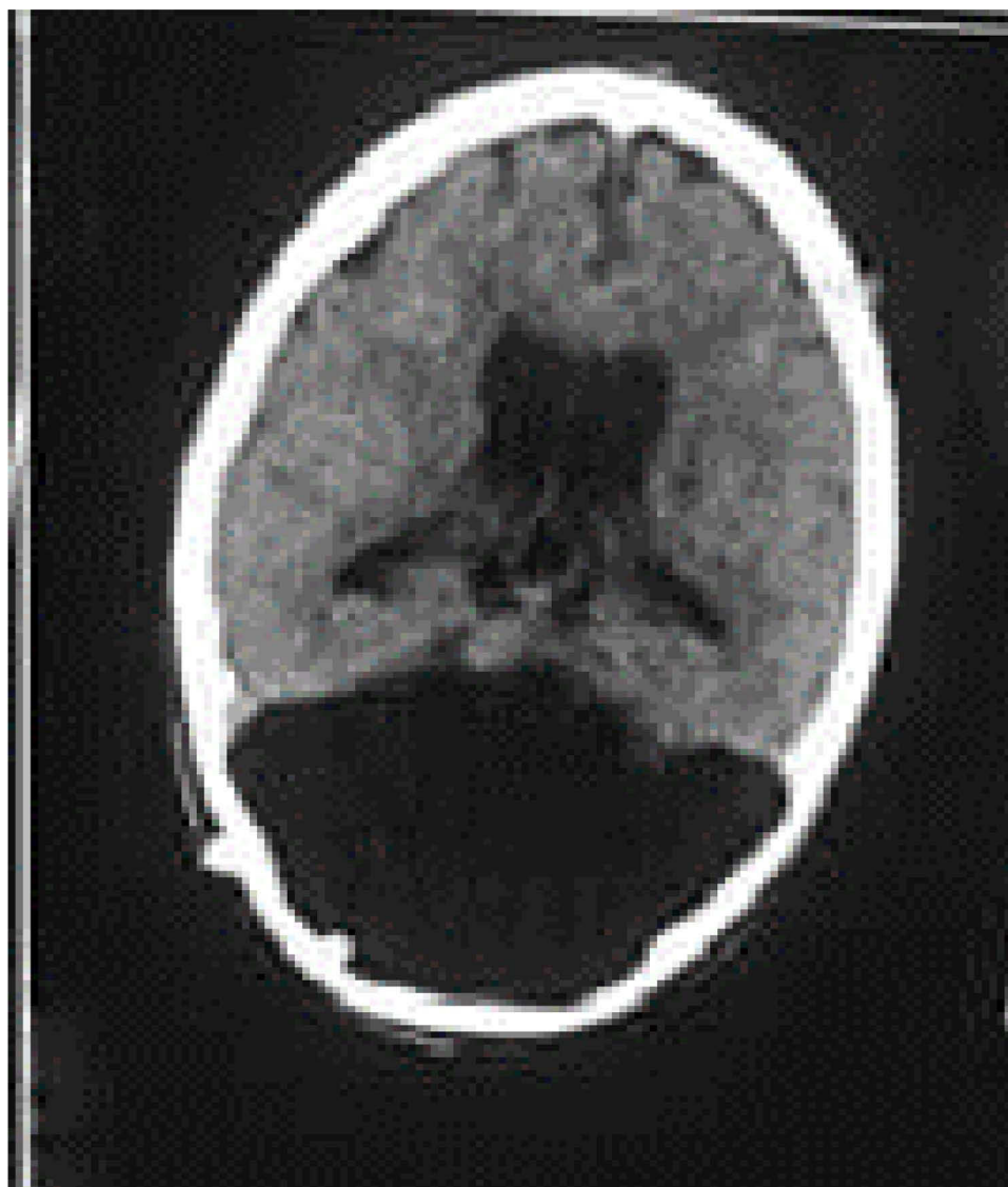
Figure 1 Brain CT scan; showing cystic dilatation of the fourth ventricle with enlargement of the posterior fossa, evidence of hypoplastic cerebellar vermis and mild supratentorial hydrocephalus.

ventricle with enlargement of the posterior fossa (Figure 2A), evidence of hypoplastic cerebellar vermis with cephalad rotation of the vermian remnant (Figure 2B) and mild supratentorial hydrocephalus (Figure 2C). These findings confirmed the diagnosis of DWS. The patient was selected for a planned surgical operation, after obtaining informed consent from her parents. Before the procedure, a 22-gauge peripheral intravenous catheter was inserted and pre-oxygenation was performed for four minutes. Antibiotics and 1 mg midazolam and 0.5 mg morphine were administered as a premedication. To control postoperative nausea and vomiting, 4 mg IV ondansetron was administered immediately before anesthesia. Anesthesia induction was done with 2 mg/kg propofol. After adequate muscle relaxation with 1 mg/kg succinylcholine laryngoscopy was performed using a Macintosh size 3 blade with the patients' head in sniffing position by anesthesiologists with more than three years' experience in anesthesia. We recorded a Cormack and Lehane grade II view through the laryngoscopy. However, we could not intubate the patient with initial attempts to pass an endotracheal tube size 6.5 mm due to resistance of the vocal cords. The same resistance was observed with a smaller sized endotracheal tube. Then, a laryngeal mask airway (LMA) was inserted. Sufficient ventilation was established by auscultating the normal breathing sounds in both lungs. We elevated the head of the patient by 10 cm. Anesthesia was