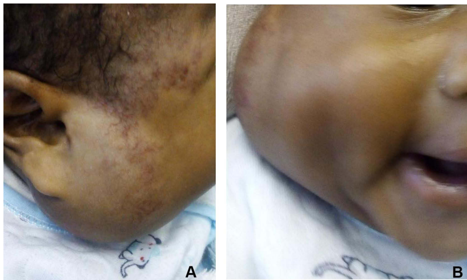
Figure 1 Large swelling in the anatomic area of the right parotid gland, prior to initiating treatment: (A) right profile; (B) front view.