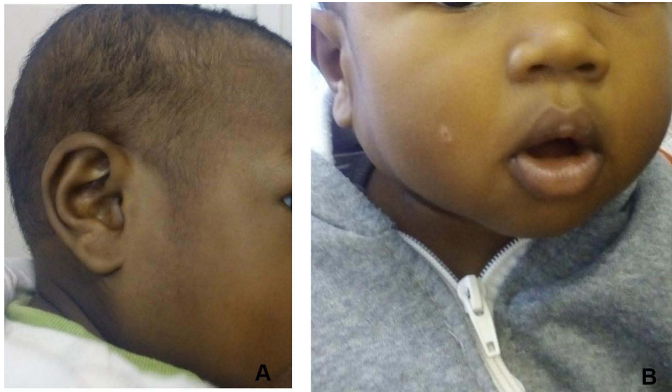
Figure 3 Marked reduction of parotid hemangioma after 10 months of oral propranolol: (A) right profile; (B) front view.

hemangiomas changed the principle in their treatment, with several reports being published since 2008. 6 In addition, propranolol is well tolerated.