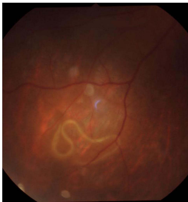
Figure 1 The subretinal larva in the inferotemporal quadrant.

The helminth can migrate to the orbit by traveling between the optic nerve and its sheath then penetrate the