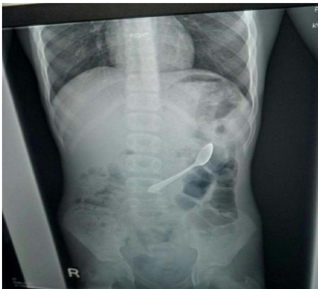
Figure 1 Plain abdominal X-ray showing swallowed spoon.

Physical examination on the date of admission to the hospital revealed a comfortable child with stable vital signs and a soft and non-tender abdomen with no any sign of peritonitis. Complete blood count was in the normal range and a plain abdominal radiograph revealed a metallic foreign body (spoon) in the mid-abdomen (Figure 1). On the next day of admission, he started to have high grade intermittent fever and epigastric and left upper quadrant abdominal pain. A repeat abdominal