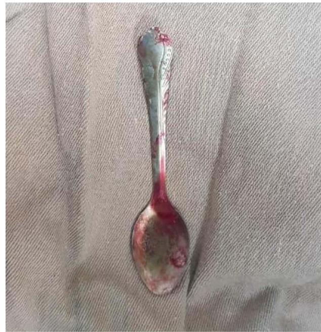
Figure 2 Metallic spoon removed from duodeno-jejunal junction.

radiograph did not show any progress. Hence, an exploratory laparotomy was done which revealed an 11 cm long metallic spoon (Figure 2) impacted at duodeno-jejunal junction with walled off perforation and erosion of the mesentery of the colon (splenic flexure). The perforated part measured about 3 \times 3 cm and had necrotic edges, but the blood supply to the rest of the bowel was intact. There was no intra-abdominal collection or intestinal content spillage. The perforated site was approached with right medial visceral rotation and duodeno-jejunal junction mobilization with division of Treitz's ligament. Necrotic edges were refreshed and a double layer Heineke-Mikulicz type repair was done (Figure 3). The surgery was smooth, the patient recovered fully after the surgery, and was discharged seven days post-operation and did not complain of anything on subsequent follow-ups.