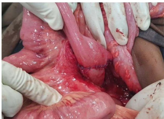
Figure 3 Repaired perforation site (DJ junction).