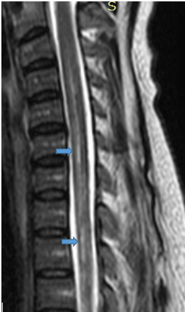
Figure 2 T2-weighted mid-sagittal image proximal to the level on previous image shows long segment expansion of the central canal (syrinx).