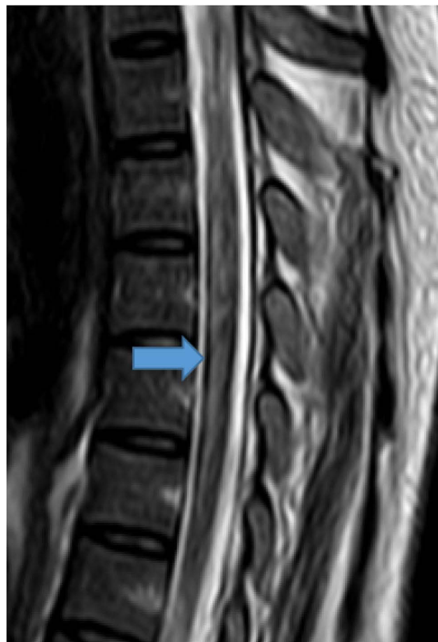
Figure 1 T2-weighted mid-sagittal image centered at T3. Long contiguous segment (T3 to T6) central T2 hyperintense lesion mildly expanding the cord.

The chestX-ray showed no abnormality. T2-spine MRI revealed long central thoracic segment (T3 to T6) hyperintense lesion with mild cord expansion. Long segment central canal dilation (syrinx) was noted in the cord proximal to the lesion (Figures 1–3). A diagnosis of neuromyelitis optica spectrum disorder (opticospinal variant) was made using the “International Panel for NMOSD Diagnosis (IPND) Diagnostic Criteria” (Table 1). The patient was started on dexamethasone 50 mg IV QID for a week and changed to prednisolone 1mg/kg (40mg) PO daily for one month, and tapered over three-to-six months. The patient was scheduled to initiate azathioprine, 50 mg, PO twice daily. Unfractionated heparin 5000 IU SC twice daily for two weeks and early physiotherapy were initiated. The patient was discharged after two weeks in the medical ward, and was referred to a neurology follow-up clinic. The patient never showed up at the follow-up clinic after discharge.