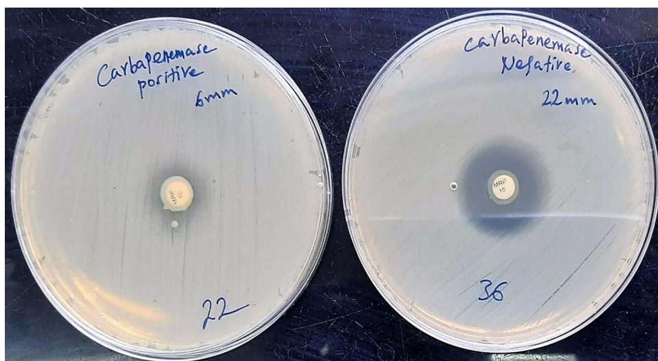
Figure 2 Modified carbapenem inactivation method results for tested P. aeruginosa at national reference laboratory Ethiopia.

In this study, P. aeruginosa (98%) was the most prevalent species and the remaining was P. putida (2%) identified as the common cause of human pathogen among the genus Pseudomonas . Similar results were reported in Ethiopia and elsewhere in the world; 11–13 these reports included a few uncommon species such as P. luteola , P. stutzeri , P. mendocina , P. pseudoalcaligenes , and P. fluorescens which were not seen in this study.