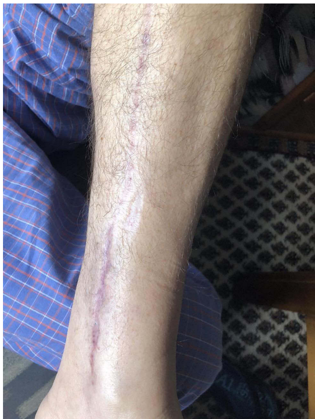
Figure 6 Three months post initiation of human growth factor treatment.

The patient had no complications, and the pain was almost negligible three days following the first application of the serum. The total amount of AQ Recovery Serum used was 15 cc (approximately four vials). Follow-up at three months showed total wound closure with only a minimal erythematous scar (Figure 6).