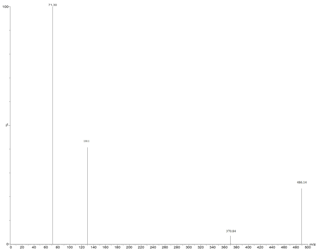
Figure 1 Product ion spectra of [M + H]^+ of metformin, afatinib (IS), fragmentation ion scans. Y-axis is Relative intensity (cps); X-axis is mass-to-charge ( m/z , Da).

Additionally, the use of the mobile phase in the combination mentioned above as well as the ammonium formate buffer (pH 7.0) is the best for the both MET and IS separation. Comparable results were obtained using the phosphate buffer for the best for separations (pH 7.0). 29,38,39