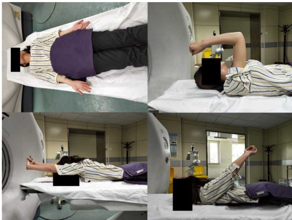
Figure 1 Image shooting movements between the 4 different positions: 1) resting position, 2) 90° of anterior flexion, 3) complete anterior flexion, and 4) complete posterior extension of the shoulder.

An independent sample t -test was used to compare the data of the two groups (left-side dominant and right-side