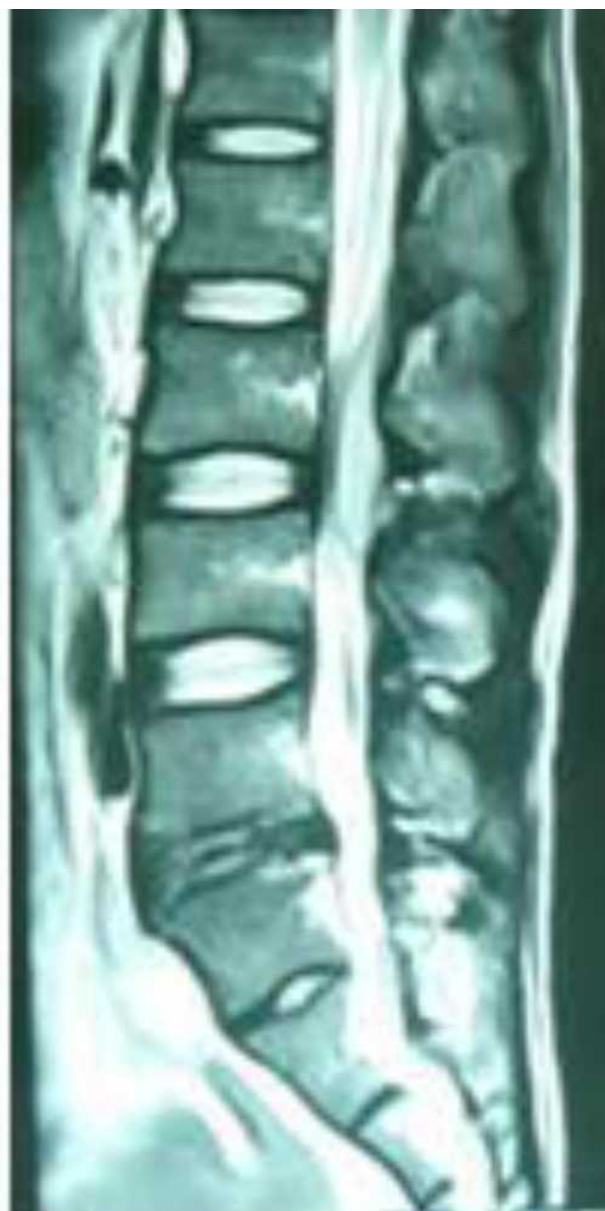
Figure 1 MRI-longitudinal view, five days after epidural catheter insertion, showing L3-4 epidural abscess (arrow).

We then transferred the patient to a hospital capable of spinal surgery where the lumbar spine MRI scan was obtained and showed an abscess at lumbar L3-4 and sub-arachnoid inflammation (Figures 1 and 2).