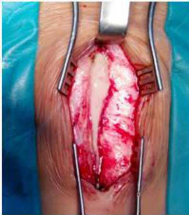
Figure 3 Image of lumbar epidural abscess during surgery.

Five days after neurosurgery, she had completely recovered. She had no fever, fully recovered movement, and had no sensory disturbances.