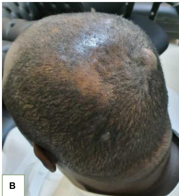
Figure 1 The patient with fluctuant, tender nodules with overlying alopecia. (A and B) Posterior and lateral views to show enlarged nodules in the scalp.