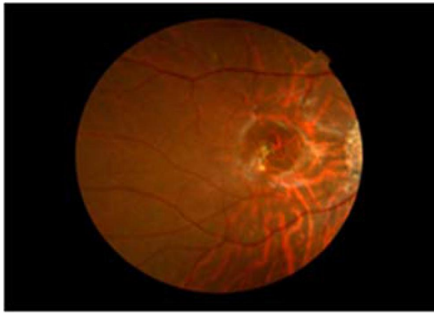
Figure 4 Fundus picture of the right eye of an 18-year-old Ethiopian patient with Bardet-Biedl syndrome showing waxy optic disc pallor, myopic peripapillary atrophy, retinal pigment clumping, and central macular scar.