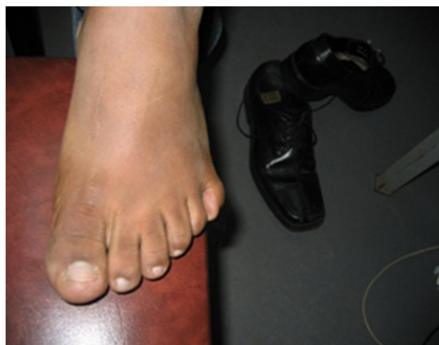
Figure 2 Sixth toe (polydactyly) in the left lower limb of an 18-year-old Ethiopian patient with Bardet-Biedl syndrome presented to Menelik-II Hospital Ophthalmology Department, Addis Ababa, Ethiopia.