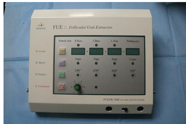
Figure 1 FUEPK-7000 hair follicle drilling machine.

A folliscope hair detection analyzer, a FUEPK-7000 hair follicle drilling machine (LeadM, South Korea), and a number of