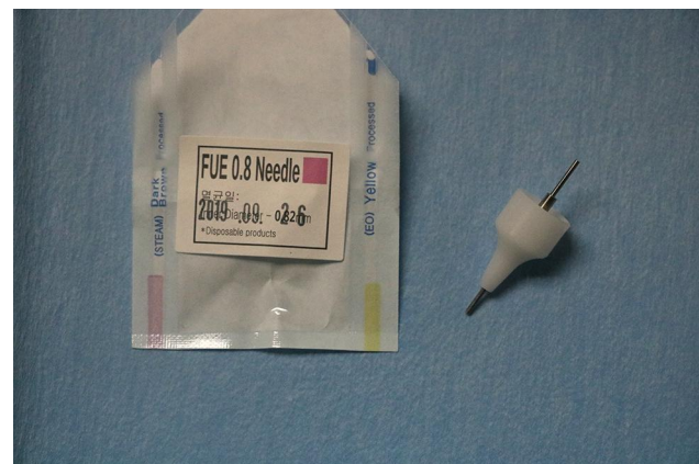
Figure 2 The drills produced by LeadM in South Korea.

For each alopecia patient, a quarter of the donor area was randomly selected for FUE drilling by each of three young surgeons (A, B, and C). (Arrangements were made for one of the doctors to continue to extract hair from the remaining quarter, but this fourth site was not included in the statistics.) For each surgeon, the total number of hair follicles drilled and the number of hair follicles successfully drilled in ten minutes were respectively recorded. Then, the invalid extraction rate in FUE was calculated. The results were analyzed by statistical data processing. A line chart was drawn, and the development trend was observed.