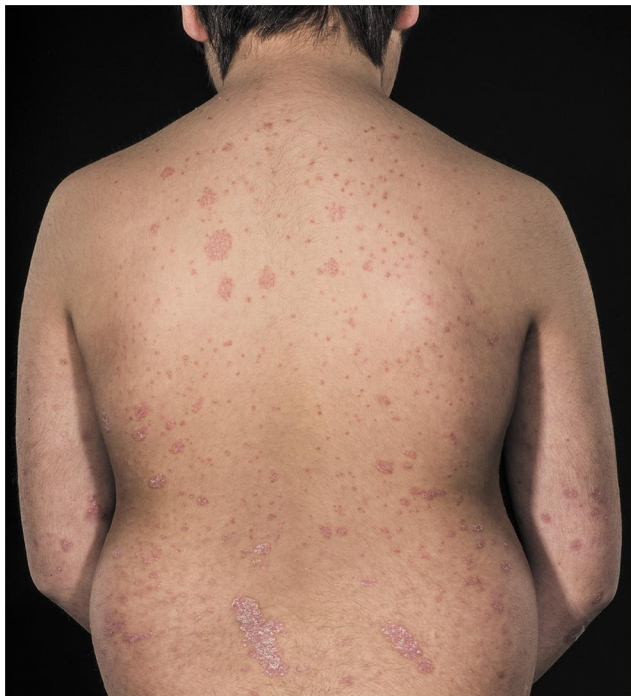
Figure 1 Mixed plaque and guttate psoriasis on the back of a 9-year-old boy.