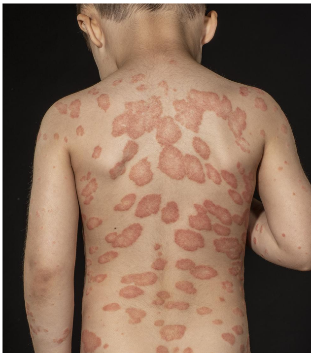
Figure 2 Plaque psoriasis on the back of a 4-year-old boy.

four months but still had residual plaques. The patient is still being treated with MTX, and a combination of vitamin D analogs, while betamethasone dipropionate gel is used for flares.