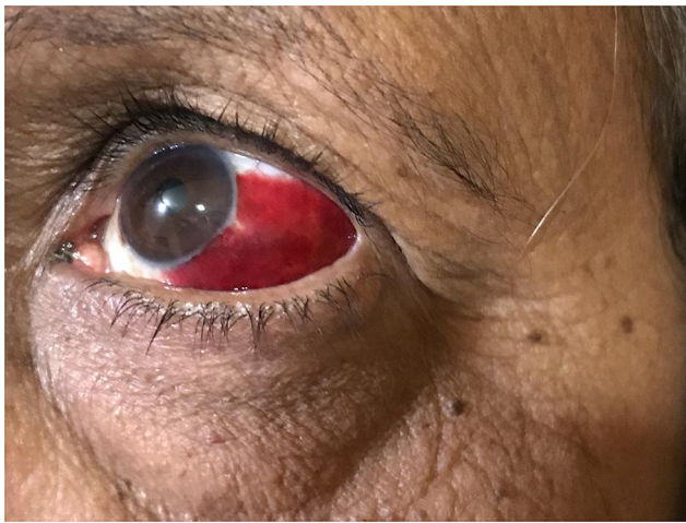
Figure 1 Showing subconjunctival hemorrhage.

population. Therefore, we designed this study to determine the incidence of NTSH in the Indian rural population.