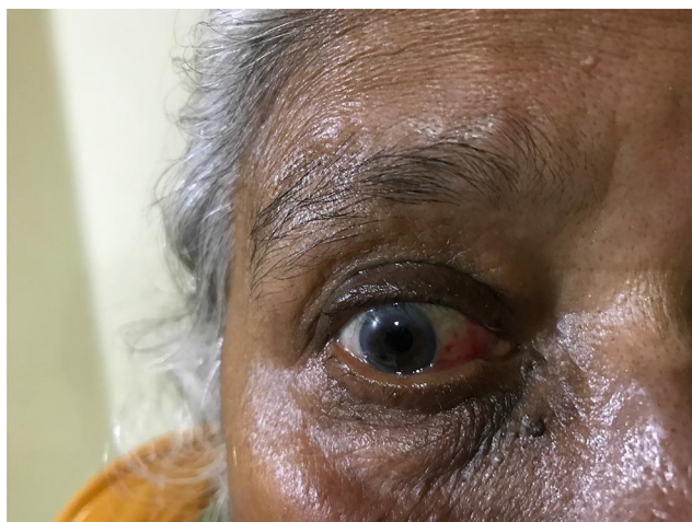
Figure 2 Showing Conjunctivochalasis of the lower lid with subconjunctival hemorrhage.

In this OPD-based study of NTSH in the rural population, the proportion of patients attending the ophthalmology department was 3.07 per 1000 patients during the year